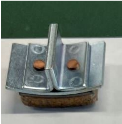
L-type 新 <New>